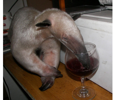
I think the problem is more related to letting the ant-eaters drink.